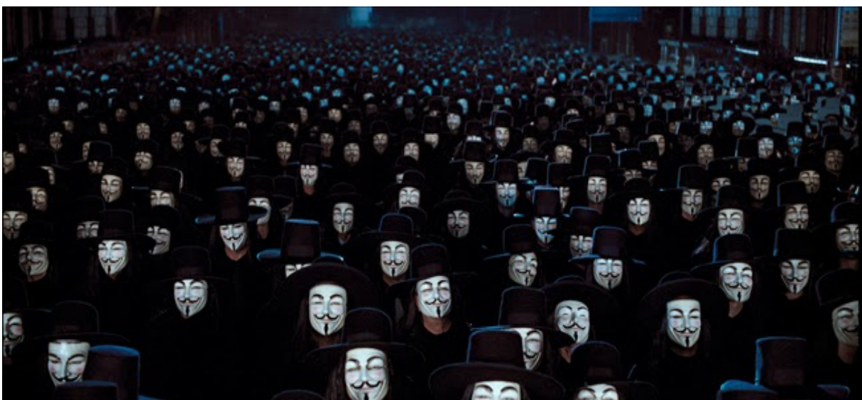
Figure 1 People marching towards the Parliament in the last scene of the film version © Warner Bros.

Through its visual iconography, the film provides mainstream vocabulary of post-modern anarchism (Call 2008, 154), which has been appropriated by protesters as a way to give support to their causes. Furthermore, it seems that demonstrators have transposed the film's last scene into reality, with a mass of masked citizens marching in the streets (Fig.1), imitating or replicating V's acts as an inspiring revolutionary image which may be considered as a new icon of popular culture.