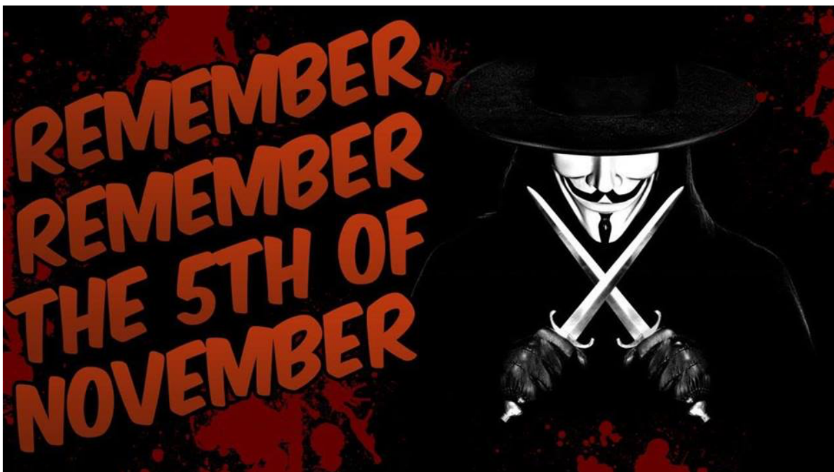
Figure 2 An image from the promotional campaign of the film V for Vendetta

Increasing its dramatic effect, V always wears a Guy Fawkes mask to cover his face, disfigured by fire when escaping from a government's resettlement camp. He is highly knowledgeable in the arts of combat and he is an expert in explosives, but he is also highly self-educated in literature, rhetoric, and politics, as the number of titles that are present on the shelves of his refuge suggest. First Moore and later the Wachowskis use V as a kind of reborn Guy Fawkes, an allegorical figure who demands justice and freedom at all costs, as it can be seen in picture 2 below from the film's promotional campaign. What is really undeniable is the use of Shakespeare's cultural authority to reinforce the position of the antihero and justify the use of violence as a means to reach a fair ending, as I will examine more in depth further on.