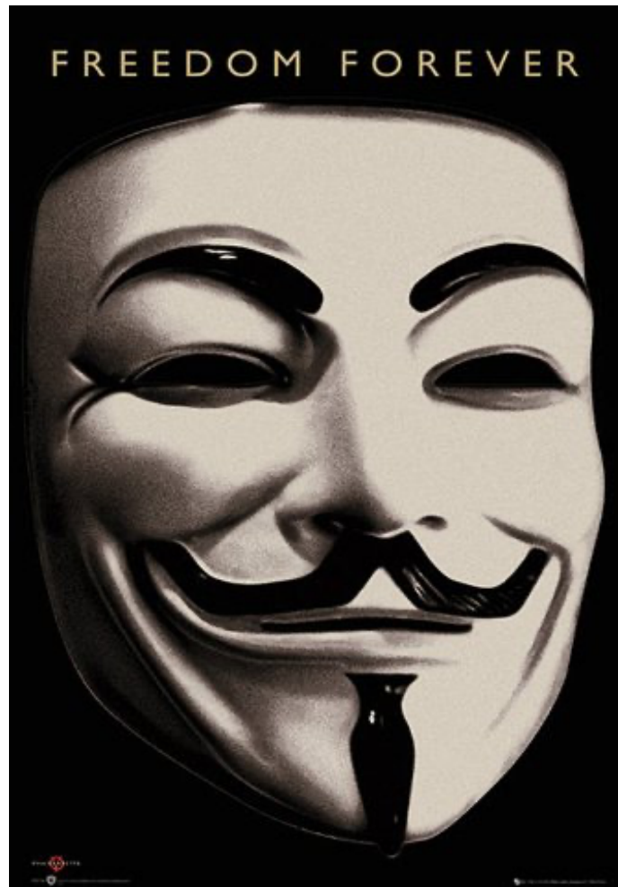
Figure 3 The mask from the film merchandising with one of V's popular visual elements

In fact, V acts all the time as a stage avenger, someone who is self-conscious of being performing all his scenes as a theatre character. He recites Shakespeare recurrently, “to signal the film’s employment of the conventions of Renaissance revenge tragedy” (Friedman 2010, 118), while he is wearing his costume—a mask, a hat, a cape, a wig and a pair of gloves—as part of his role. Therefore, he appears as a revenger in the fashion of Shakespearean characters such as Hamlet, seeking retribution, but also pursuing justice at all costs.