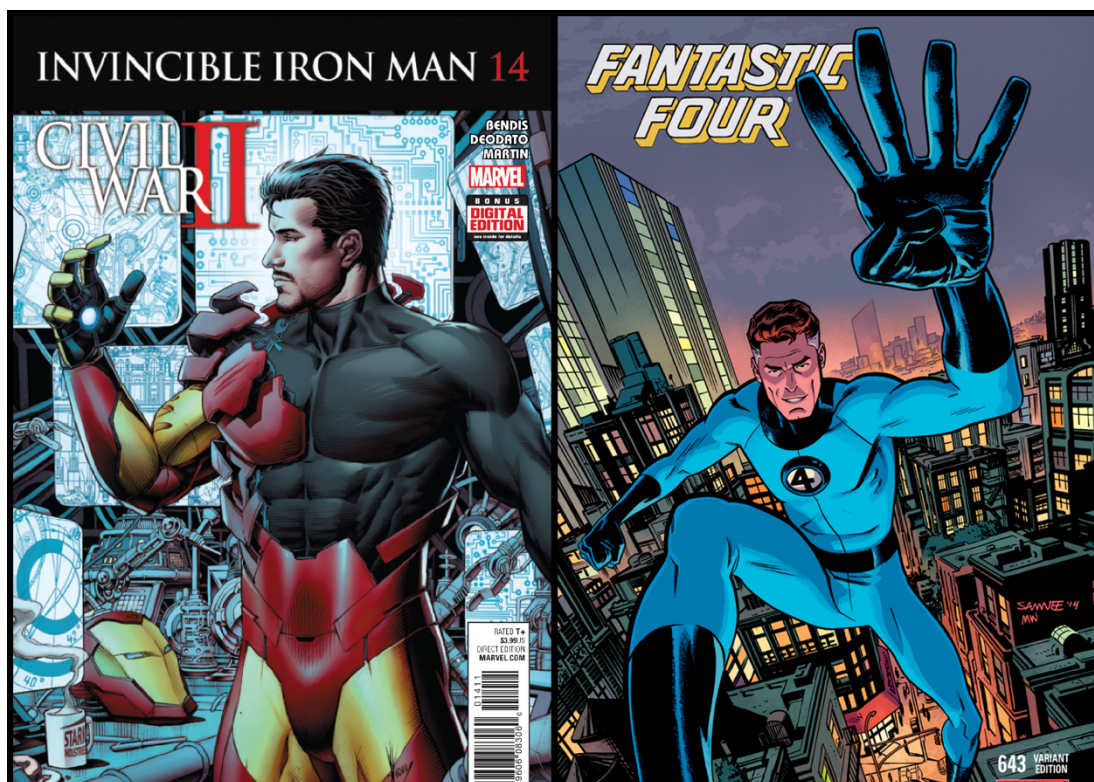
Figure 4 Nico Minoru (from Marvel's Runaways, left panel) and Jean Grey (Phoenix of the X-Men, right panel) possess abilities that are perceived as valuable to success in STEM.