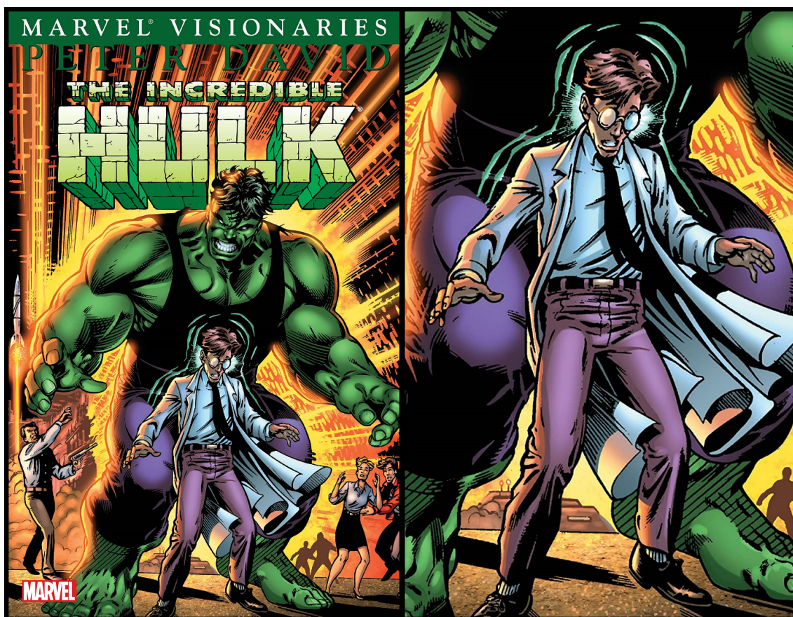
Figure 2 Dr. Bruce Banner (alter-ego of the Incredible Hulk) possesses many of the features of the STEM professional stereotype.

One important social barrier in STEM is produced by the STEM professional stereotype (Cheryan et al., “Cultural Stereotypes as Gatekeepers” 3; see figure 2). The STEM professional stereotype is our culture’s general, shared concept of what a STEM professional is. The STEM professional stereotype includes the physical features, typical behaviors, personality traits, and skills that come to mind automatically when we think of a person working in a STEM field. Physical features of the STEM professional stereotype include being male, white, elderly or middle-aged, and unattractive (Finson 341, 335; Steinke, “Adolescent Girls” 2). The stereotypical STEM professional wears glasses and a white lab coat (Finson 336; Steinke, “Adolescent Girls” 2). The personality of a stereotypical STEM professional is geeky or nerdy, and they are socially awkward (Steinke, “Adolescent Girls” 2). They mostly work alone (Steinke, “Adolescent Girls” 2), in a laboratory (Finson 335), performing dangerous experiments (335), and their work is dissociated from communal goals (Diekman et al., “Seeking Congruity” 1054). Lastly, the stereotypical STEM professional is very intelligent (Ward 8), often due to an inborn brilliance or genius (Leslie et al. 263).