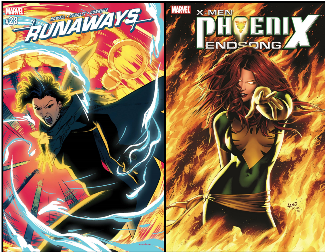
Figure 3 Tony Stark (Iron Man, left panel) and Reed Richards (Mr. Fantastic of the Fantastic Four, right panel) are inventors with advanced knowledge that spans multiple sub-disciplines of STEM. Both characters also possess many of the features of the STEM professional stereotype.