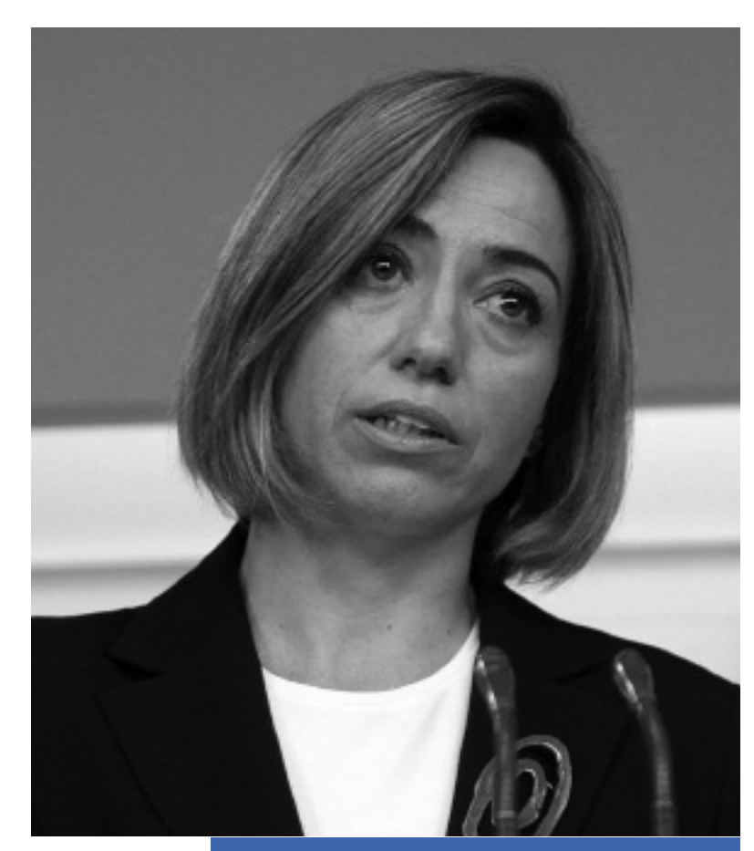
Carme Chacón, the first female Minister of Defence.

Looking towards the near future, there are potential female presidential candidates on the horizon in both countries. In the U.S. a